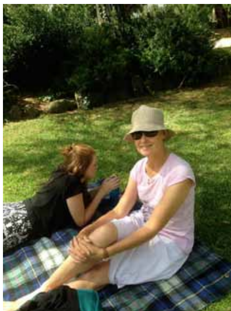
Enjoying St Kilda Botanic Gardens, Melbourne.

In November I had a wonderful tour around the Australian Garden at RGB Cranbourne (approx 45 kms SE of Melbourne city) on board 'The Garden Explorer', a motorised people-mover that circulates around the Garden every 20 minutes. This makes much of the 363 hectare site accessible to everyone and provides the perfect answer to visitors who may be pressed for time. I was 'blown away' by the scope and beauty of Stage 2. In February I thoroughly enjoyed a birthday gathering on a perfect day in the RGB Melbourne. In March, I was enchanted by the St Kilda Botanical Gardens in inner Melbourne where I discovered many 'Garden Rooms', each with its own character. Patrons of all ages were enjoying picnics, baby groups, reading, sunbathing, the cool interior of the conservatory, exercise and even juggling!