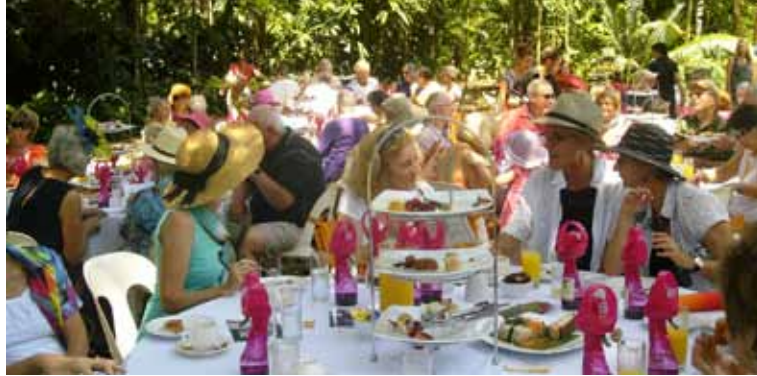
Friends celebrating their 25 th birthday with a tea party in the stunning grounds of the Cairns Botanic Gardens.

The weather was beautiful and the setting in the tropical gardens stunning when current and former Friends gathered late in 2014 to celebrate 25 years of voluntary service and fundraising for the Cairns Botanic Gardens.