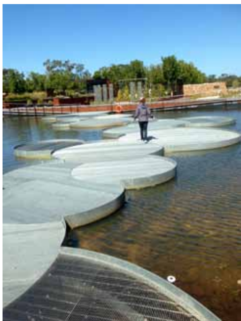
Lilypad bridge at the Australian Garden at RGB Cranbourne.