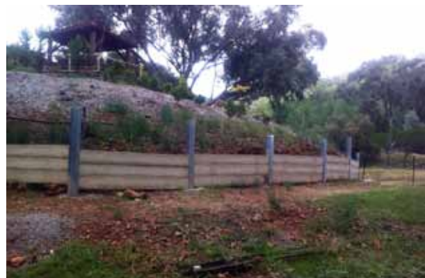
Bamboo Walk and a path under construction.