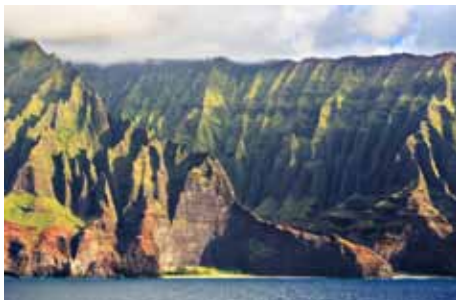
Aerial view of the remote Na Pali Coastline Kauai, Hawaii.

Foundation and Friends of the Botanic Gardens have been running tours for our members since the late 90s. Since then the tours program has expanded greatly to include well known garden destinations in Europe and the United Kingdom as well as the more exotic locations such as Peru, the Galapagos Islands, Iceland and Madagascar.