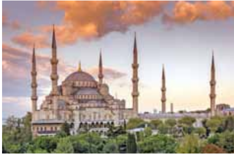
Blue Mosque, Istanbul, Turkey.