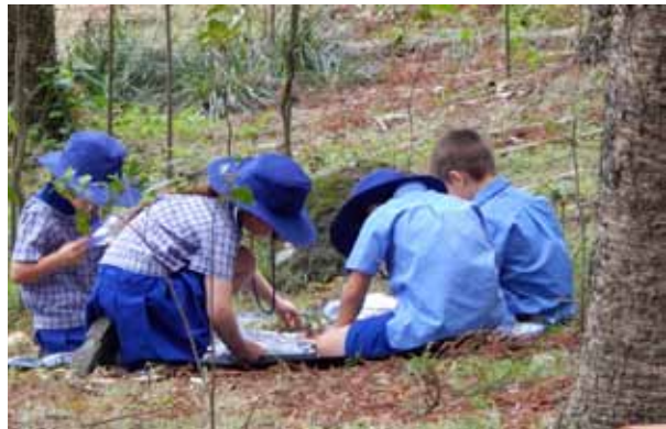
The track in the Hoop Pine forest and school children at work in the forest

An established educational area is our Useful Plants Garden. Here we have plants used by the local indigenous people and early settlers for food, medicine, weapons, tools, shelter etc. We have large illustrated signs describing many of these plants and indicating where they can be found. Our Wilson Park Garden, a wonderful example of young dry rainforest, is an ideal area for those wanting to learn about establishing rainforest in their own home gardens or on larger properties. Our Uncommon Plants Garden is of special interest to those doing research into the rainforest plants which are sometimes difficult to find in the wild. And our Sensory Garden will be a place in which to learn on all levels.