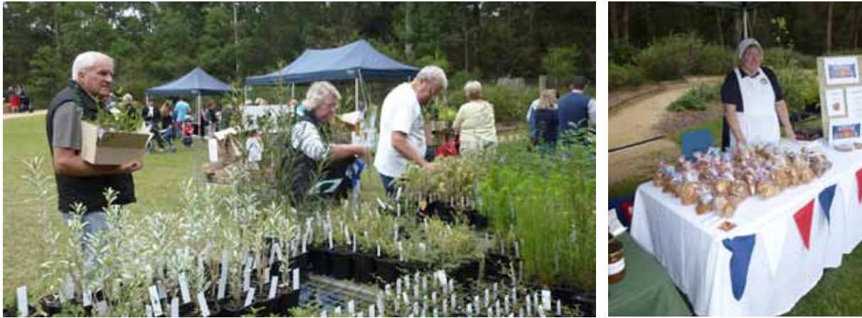
Plant Sale in full swing and our 'WW I nurse' purveying Anzac Biscuits, Easter Saturday 2015.

Friends of Eurobodalla Regional Botanic Gardens Batemans Bay, New South Wales