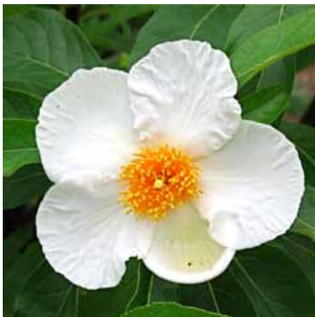
The flowers of the Franklin tree are showy and approximately 9 cm in diameter.

The Friends now hold two-hour Working Bees at the Arboretum on Tuesday and Thursday mornings and there was no shortage of volunteers willing to plant out some of the new saplings.