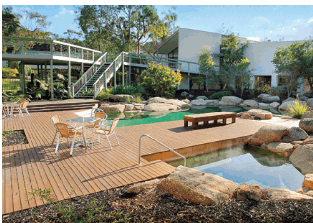
Map showing location of Gardens and Conference Centre and the luxurious surroundings at the Conference Centre.