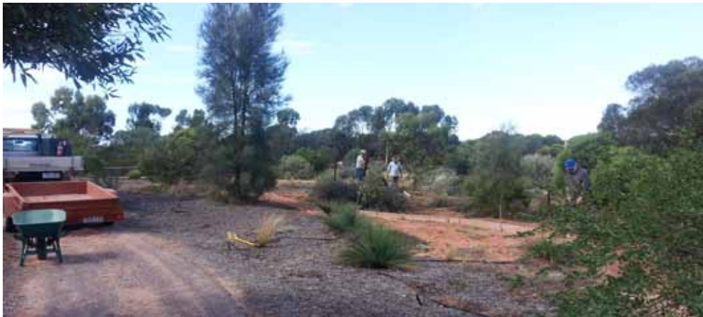
Working on the Bush Tucker garden

Friends of the Australian Arid Lands Botanic Garden (AALBG) Port Augusta, South Australia