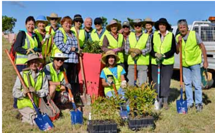
Friends' volunteers ready to plant out some of the Franklin tree saplings on Thursday 5 March. The pink tree guard contains one of the trees planted in 2010.

Arboretum staff have also been collecting and successfully germinating seeds from the Wollemi pines ( Wollemia nobilis ). Although many of the trees planted in the Wollemi forest failed to thrive, there is one area where many are over 2 metres tall, with two trees exceeding 3 metres. These are developing well and producing many cones.