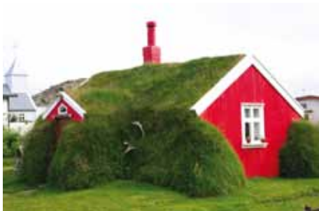
Traditional Icelandic home.