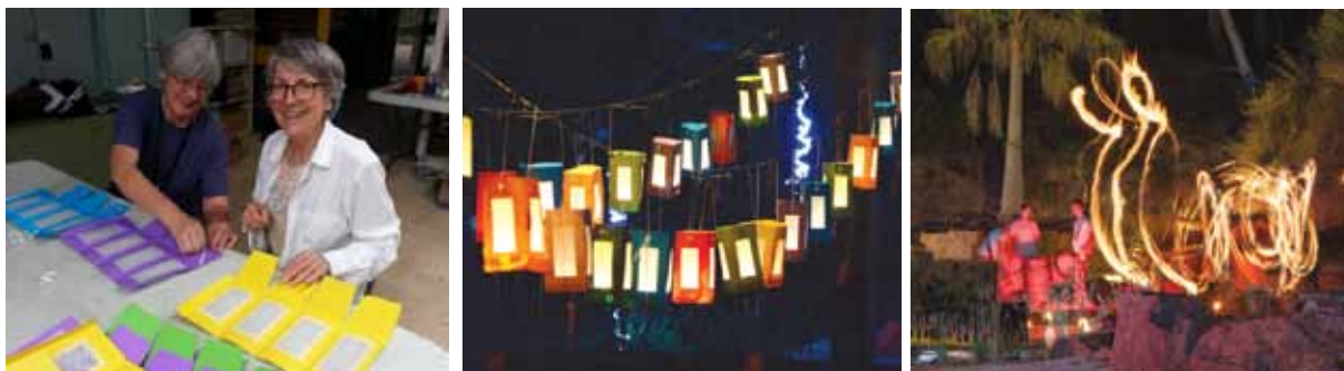
Friends making lanterns ; Lanterns in the Friends shelter ; Drummers and fire in the Red Centre.