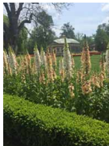
Spring splendour in my home Ballarat Botanical Gardens