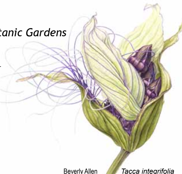
Beverly Allen Tacca integrifolia

The largest herbarium digitisation project in the southern hemisphere is underway at the Royal Botanic Garden Sydney. This will share and protect the 1.4 million botanical specimens at the National Herbarium of NSW. Sharing the collection with the world will create opportunities for this vital data to be used by scientists across the world, helping protect our plants for the future. The project will also protect our collection by removing the need for physically handling specimens, keeping them intact for future generations. It costs just $2 to digitise a specimen. Please visit www.rbg Syd.nsw.gov.au/donate to support this important project.