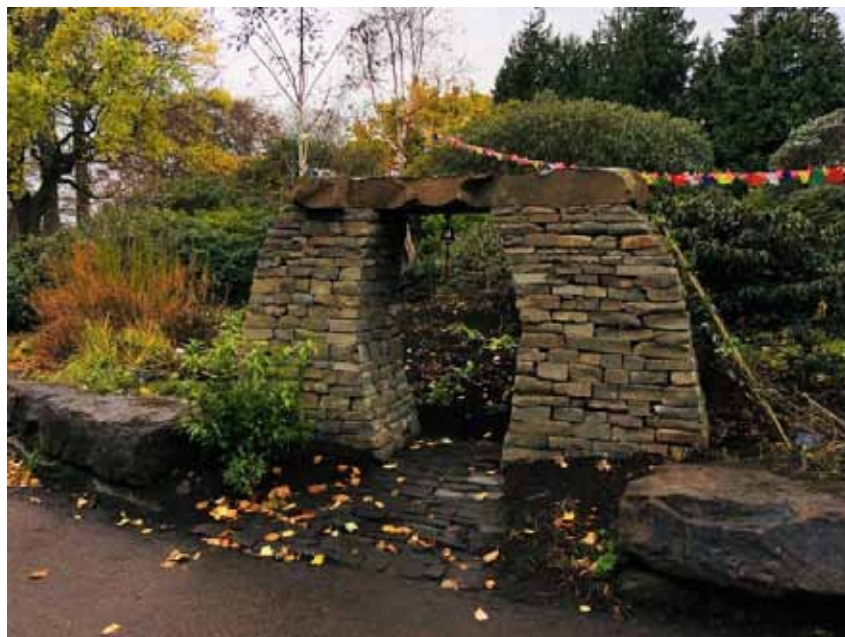
The Nepalese Gate