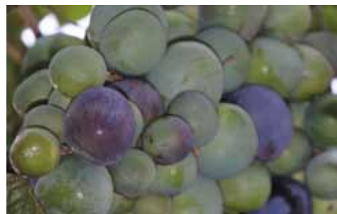
Ormeau Bottle Tree ( Brachychiton sp.). Small Leaved Tamarind ( Diploglotis campbellii ). Mullumbimby Davidson's Plum ( Davidsonia jerseyana )