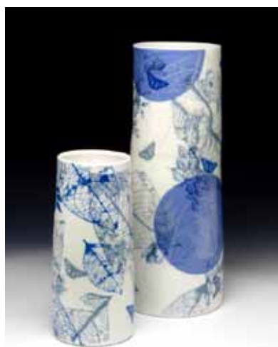
Tangled up by Mollie Bosworth, featured at Artisans in the Gardens