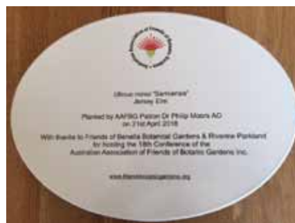
Our best wishes go to Friends of Benalla and Riverine Parkland as they adapt to change and look to their future survival. A plaque to commemorate the 2018 Benalla Conference will soon be installed at the Gardens.