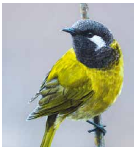
White-eared Honeyeater by Geoffrey Carran, winner of The Peoples' Choice Award at Wild Thing